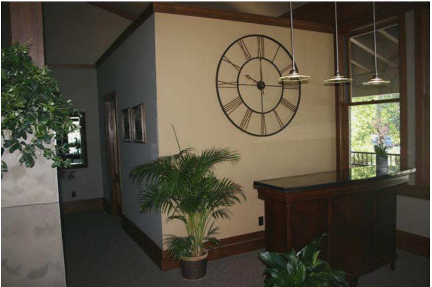
Harker Center Lounge

Those of you who have toured the new Harker Center Upgrades have seen the renovated party room. Staff is happy to report the positive comments are pouring in and many owners are enjoying the lovely space. Uses to date include several Sub-Association meetings with parties following, owner-organized functions, day-time Wi-Fi access, group games, and several private parties.